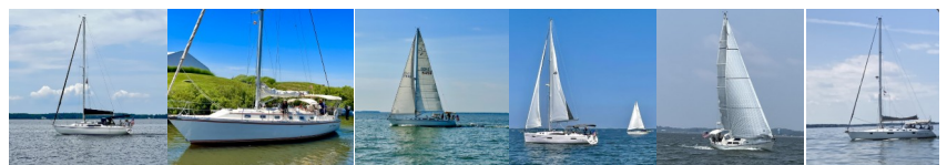
Pleasure's Mine Star Reacher Scrimshaw Seas The Day Weatherly Windward Passage