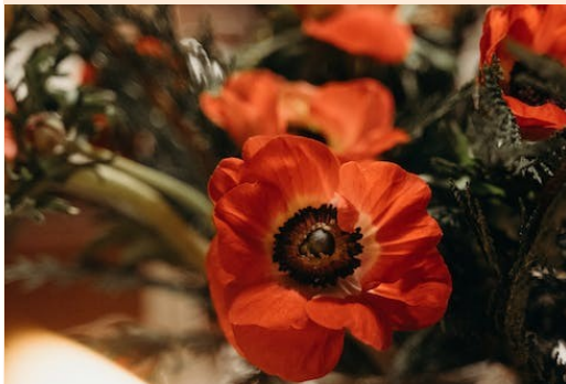
Flower of August: Poppy