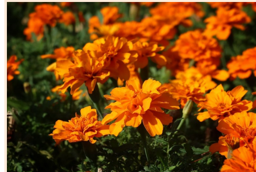
Flower of October: Marigold