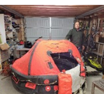
Photos provided by members or available on USPS website or by permission