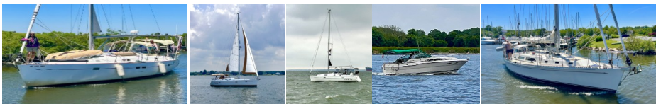
Brio Domino Eau de Vie Lady L Mystic Star