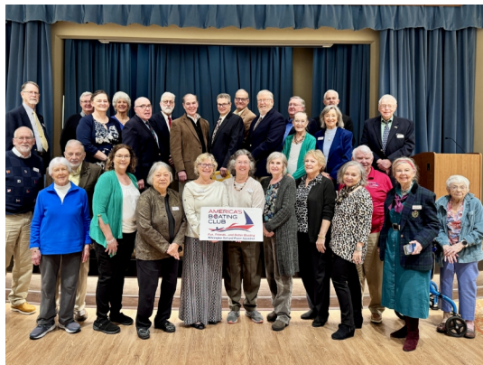
29 Members attended ABC-Wilmington's 85 th Change of Watch

Page 9 has information on a potentially interesting new Member Benefit