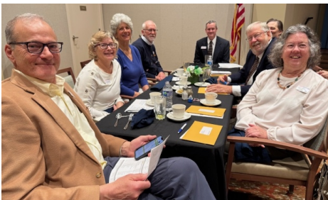
29 Members attended ABC-Wilmington's 85 th Change of Watch